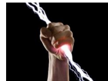
Processindustriell IT & Automation