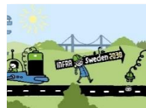
INFRA Sweden 2030