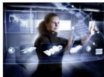
Gruv- och Metallutvinning