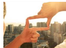
Smart Built Environment